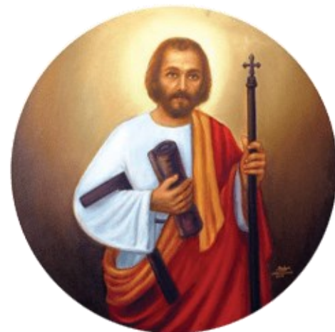
St. Thomas the Apostle, July 3

stjohnsgild@yhti.net by Noon on Wednesday.