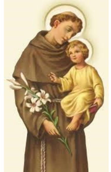
St. Anthony of Padua, June 13

stjohnsgild@yhti.net by Noon on Wednesday.