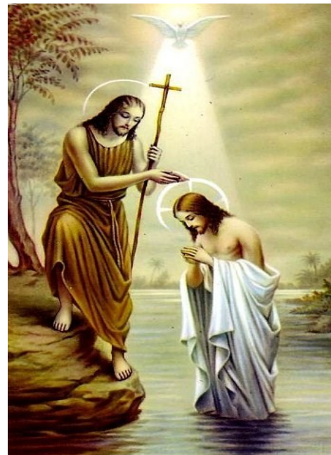
St. John the Baptist, June 24

stjohnsgild@yhti.net by Noon on Wednesday.