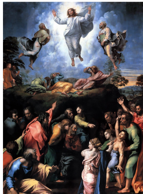
Transfiguration of Our Lord—August 6