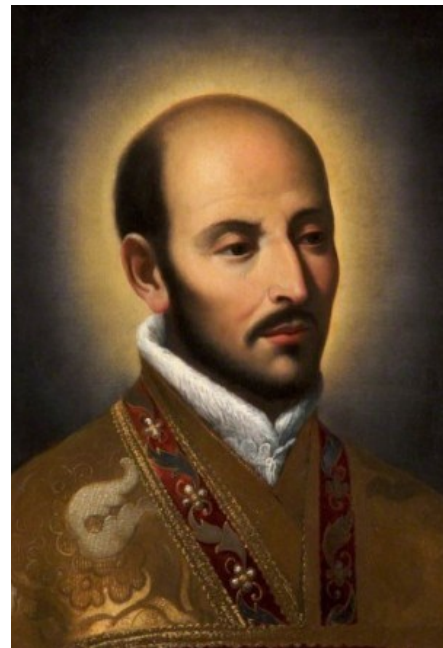
St. Ignatius of Loyola—July 31