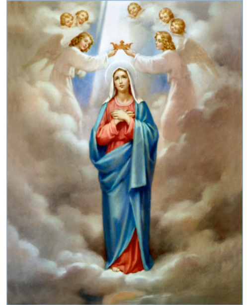
The Queenship of the Blessed Virgin Mary—August 22