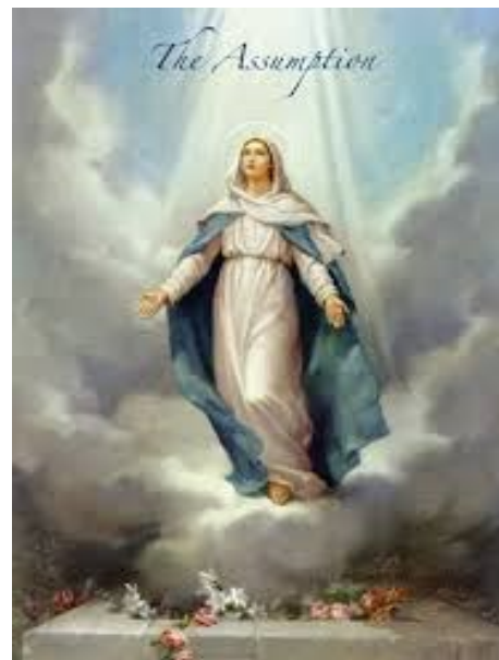
Assumption of the Blessed Virgin Mary—August 15

stjohnsgild@yhti.net by Noon on Wednesday.